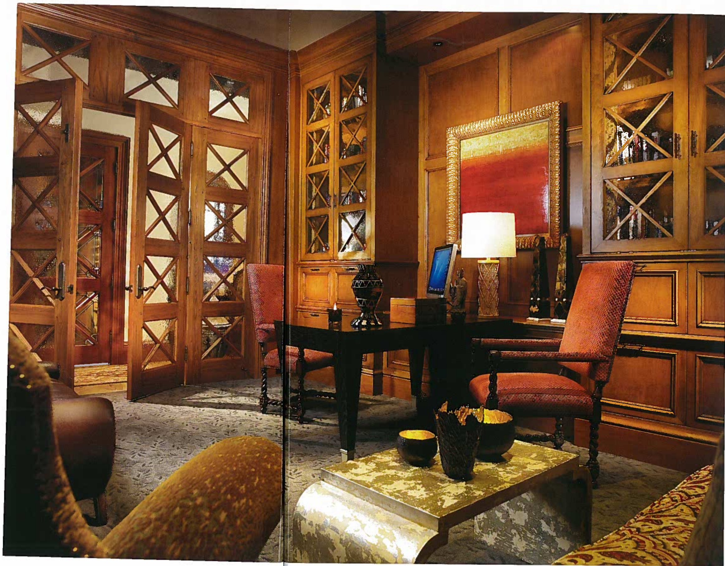
ABOVE: Oversized, comfortable seating pairs with a cocktail table from Dennis & Leen in a rubbed silver leaf finish in the husband's library. Armchairs with braided-wood legs from Panache Designs, upholstered in Scalamandré's terra cotta-toned petite dot pattern, pull up to a writing desk from Donghia, topped by a Boyd Lighting table lamp.

Inside, an eclectic mix of new and antique furnishings bestows a more relaxed edge with textural dimension throughout. The home's signature palette initiates in the living room, where sandy browns and sea spray water hues, in homage to the outdoors, pair with polished stone, warm-toned woods and silver leafed accents. Mexican Macedonia stone covers the custom-designed fireplace, flanked by two chests adorned with alabaster urn lamps, and continues in columns that lead to the elegantly formal dining room. Here, a copper-dusted ceiling defines the oval-shaped room from above, while, below, an "area rug" of sandy gold Spanish marble and polished Inca Gold limestone edged with glass tiles underscores the dining space.